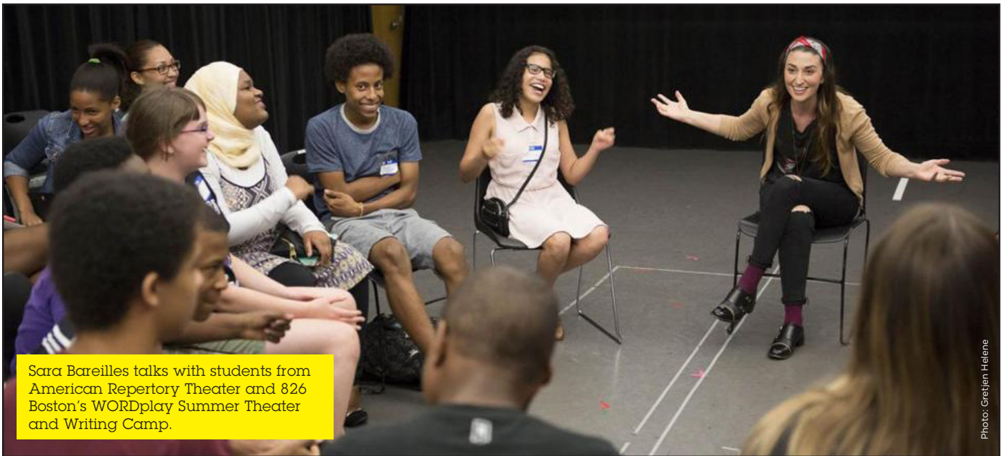
Sara Bareilles talks with students from American Repertory Theater and 826 Boston's WORDplay Summer Theater and Writing Camp.