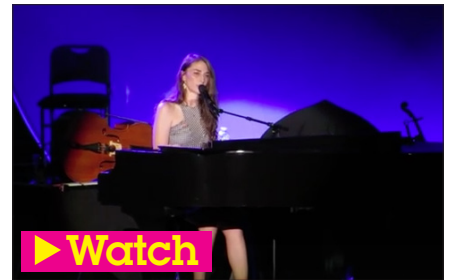
▶ Watch Sara Bareilles sings “She Used to Be Mine” in concert

She is messy but she's kind She is lonely most of the time She is all of this mixed up and baked in a beautiful pie She is gone but she used to be mine.